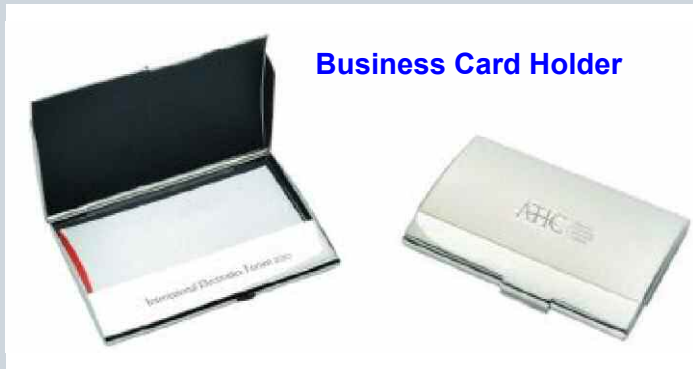
Business Card Holder