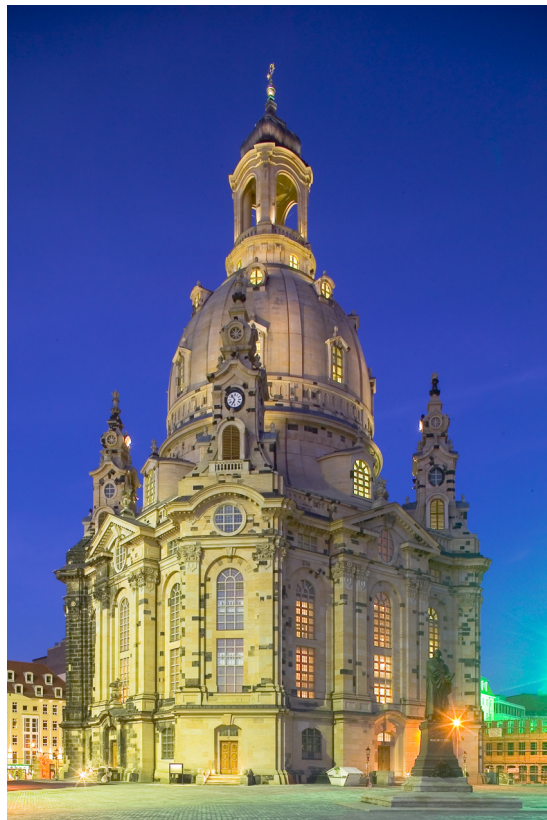
Church of our Lady – Neumarkt Quater