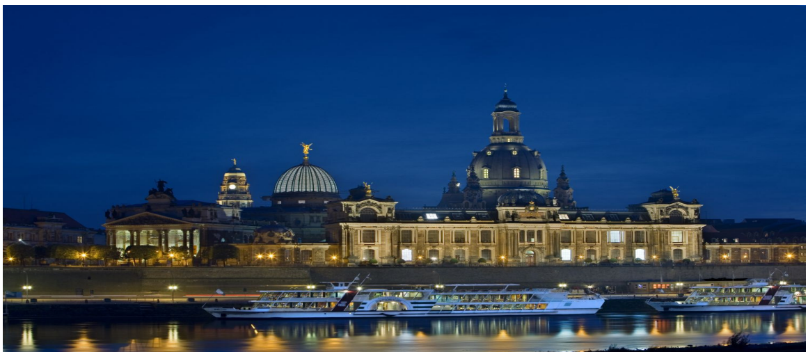
View of River Elbe & Dresden Old City